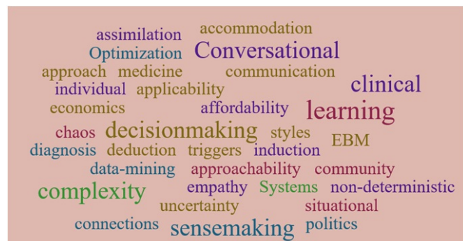
Figure 2: Pattern in Chaos - free listings of key-concepts generated during conversational learning